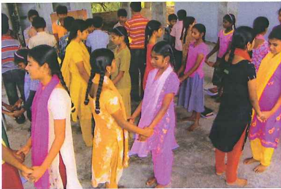
Praying for each other

One -day retreats for the children living in the Children's Homes. Two retreats were arranged for the children in Gollapudi and Nandigama. Brothers, both sons of one of our pastors, one of whom had trained in our School of Evangelism, conducted these camps with great enthusiasm and energy. All the children greatly enjoyed and have been blessed by this opportunity.