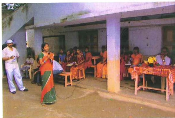
A pupil acts as teacher.....