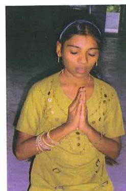
Above and below – 3 from a one-day retreat at hostels.