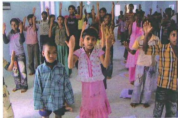
Learning action song