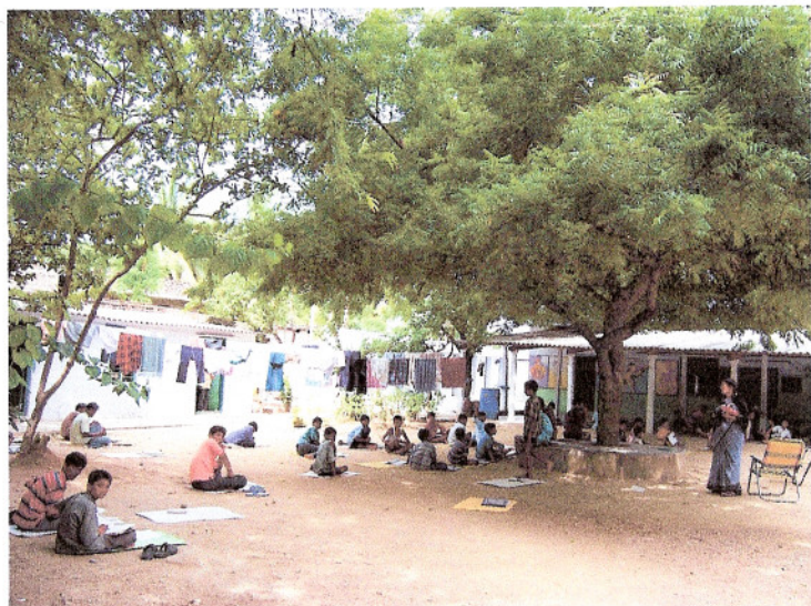
Boys in the yard of their hostel, doing their homework