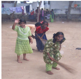
The girls are cheerful even when going about their daily chores.