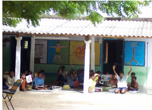
Homework is diligently done outside the hostel rooms.

The day starts early in rural India, and the children in the Gollapudi hostels roll up their sleeping mats as the sun rises beyond the paddy fields. After a cold wash, they meet to pray and sing songs. Coming from all different religions, some accept Jesus as their Lord; others consider Him in their own way among their many Hindu Gods or alongside their Muslim beliefs. All enjoy the fellowship of a loving extended family.