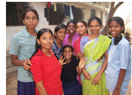
The hostel children always have a smile for you...